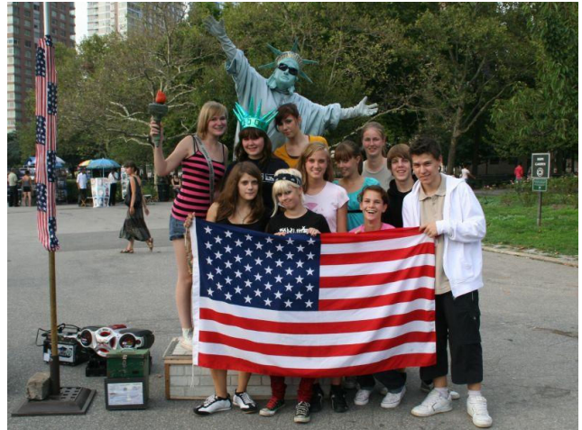
Students at the 2008 Exchange in New York

Bilingual teaching is now being extended to biology, economics / geography and sports to give the students the opportunity to improve their English in “new” subjects.