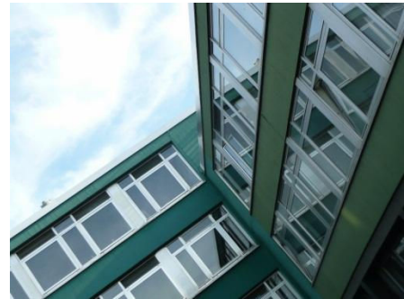
SEK II Building

During the breaks students can choose from three different schoolyards with a jungle gym or ping-pong tables. These schoolyards are surrounded by different buildings; we have our own building for arts and crafts, three gyms and different wings for natural sciences.