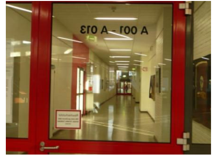
View into SEK II Building

All these buildings are well equipped. We even have our own interactive blackboard, which students designed themselves, in order to be able to use this teaching method without the high cost of systems available on the market. These systems have already been installed in several rooms. Other rooms are equipped with projectors and computers, in order to enable teachers to do multimedia-teaching.