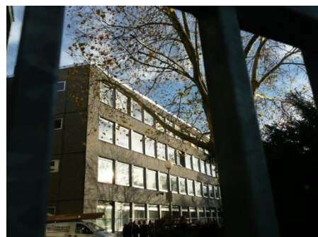
SEK II Building