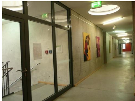
Inside the Art Wing

A few years ago, this school turned into an all-day-school, which means we provide lessons in the afternoon, where students do their homework